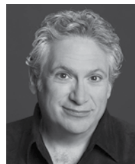
HARVEY FIERSTEIN Book