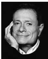
Jerry Herman Music & Lyrics

broadcast, and penned a revised book for Funny Girl . His political editorials have been published in the New York Times , TV Guide and the Huffington Post and broadcast on PBS's "In the Life." His children's book, The Sissy Duckling (Humanitas Award), is now in its fifth printing. As an actor, Mr. Fierstein is known worldwide for his performances in films including Mrs. Doubtfire , Independence Day , and Bullets Over Broadway , on stage in Hairspray (Tony Award), Fiddler on the Roof , La Cage aux Folles , Torch Song Trilogy (Tony Award), and on TV shows such as "Smash," "How I Met Your Mother," "The Good Wife," "Cheers" (Emmy nomination), "The Simpsons," "Family Guy," and "Nurse Jackie."